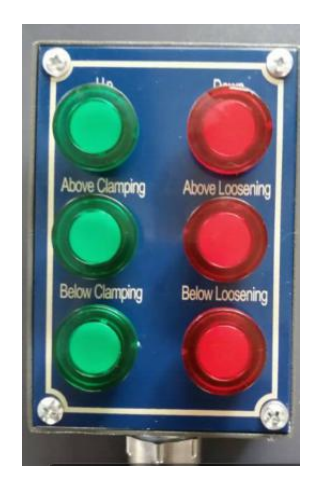
Controller for clamp